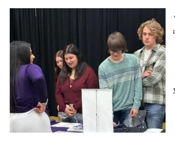
AB juniors and seniors had the opportunity to attend a post-secondary education fair at Mid-State Technical College. There were representatives from around 60 different options including 4-year colleges, technical colleges, military, etc. The students had a great morning!